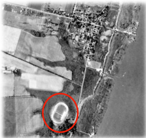
Aerial View 1954

Races were every Sunday during the season beginning at 2pm, with a 1pm warmup. Featured drivers raced in a series of five races each event day, earning points for a series champion at the end of the season. The August 4 1951 Morning News stated, "Top daredevils from Delaware, Pennsylvania, New