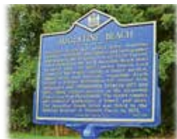
Historic Marker at Augustine Beach