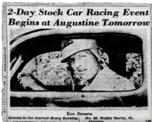
News Journal, 09.01.1951