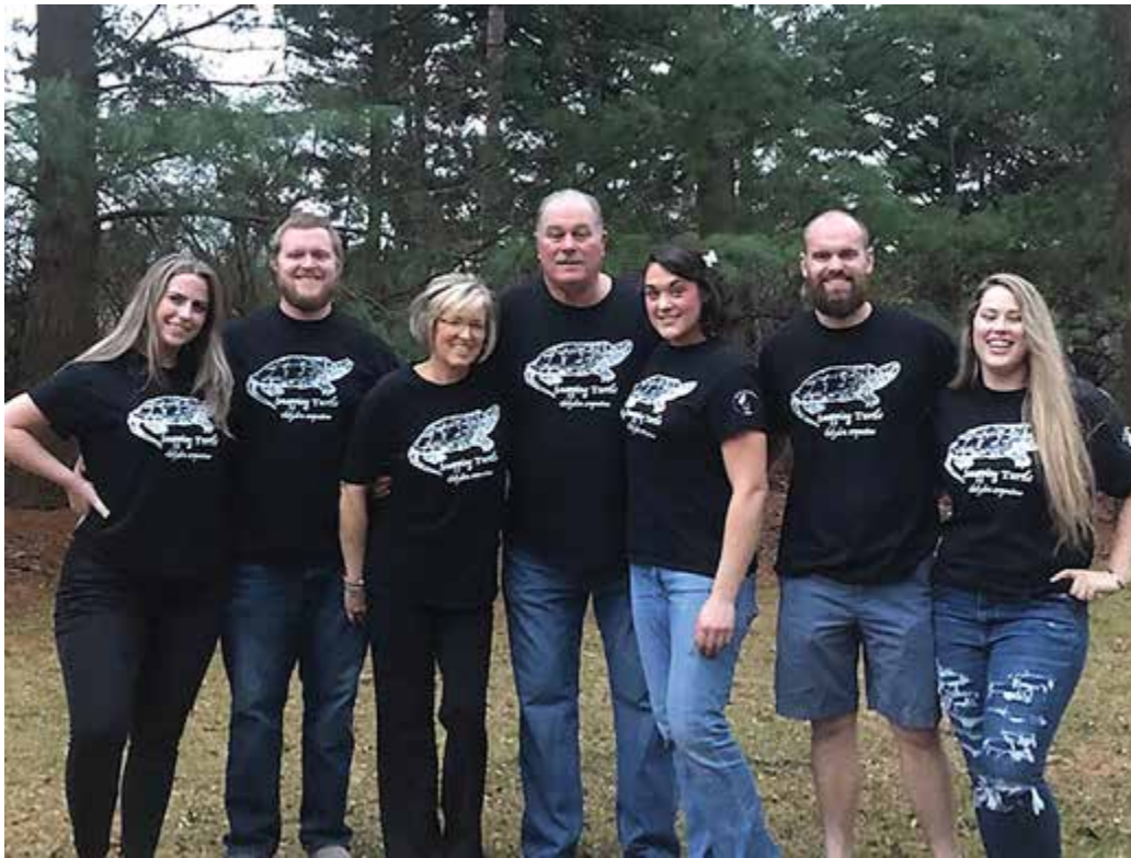
A BIG thank you to the Scully family and friends for their support by posing in PPAHS's snapping turtle t-shirts!