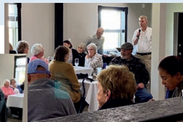
Members' Event at the Augustine Inn