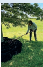
Mulching at Augustine Beach