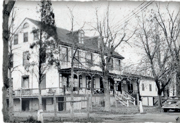
Augustine Beach Hotel (Pier House) circa 1940