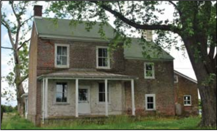
Figure 1: The Alrichs House from the north side, clearly showing the three stages of construction

When the Dutch first settled in Delaware in the late 1600s, one prominent family name was Alrichs.