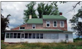
Figure 2: The south face of the Alrichs House

The house consists of three sections. The eastern section is perhaps the oldest, built circa 1760. There is a shorter wing added around 1780, and a kitchen addition added later. The house faces south with a dramatic view of the Delaware River. The south façade, originally the main entrance to the house, is hidden by a porch.