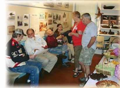
Stewart Cemetery 2013