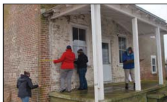
Figure 3: Members of CHAD measure and record the dimensions of the Alrichs House

There are lots of unanswered questions about the building. Where did the brick come from – was it carted south from New Castle, or was there a local brick yard? How about the sawn wood – was there a local sawmill back in the late 1700s? Where were the outbuildings located – the smokehouse, privy, barns, brewery?